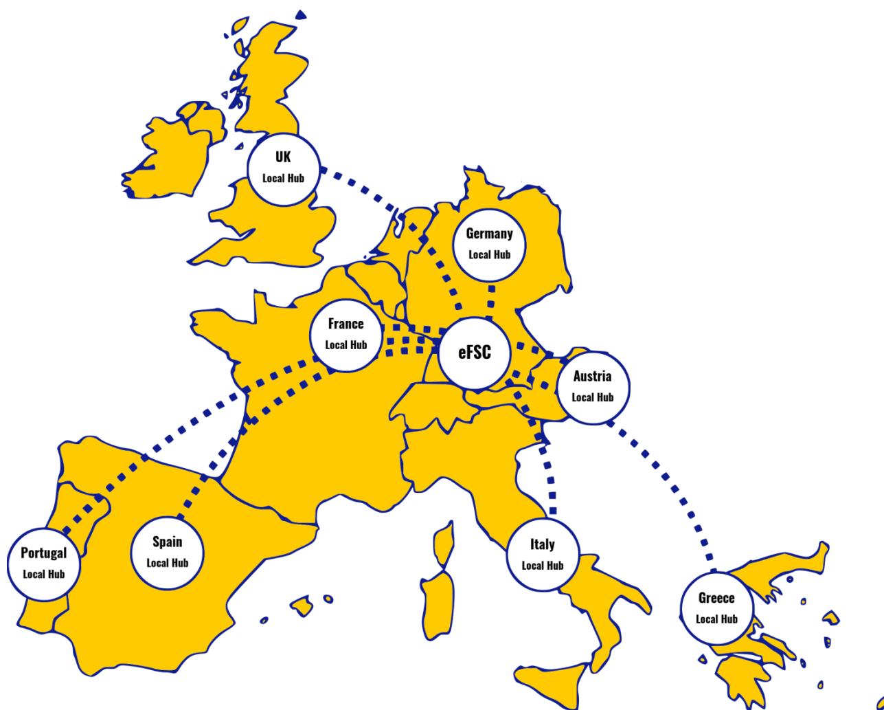
Figure 1. EuFood-STA centre hubs

They will promote the project with leaflets, posters and/or presentations during national events where academia sector and/or food industry are involved.