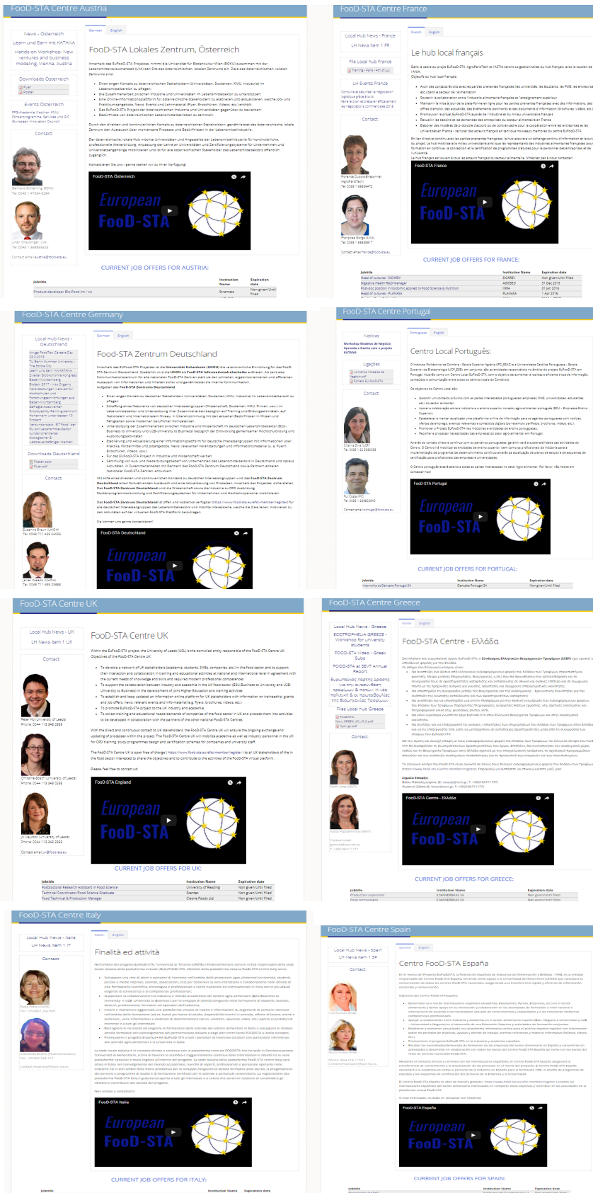
Figure 5. Overview of the 8 local hub sub-sites