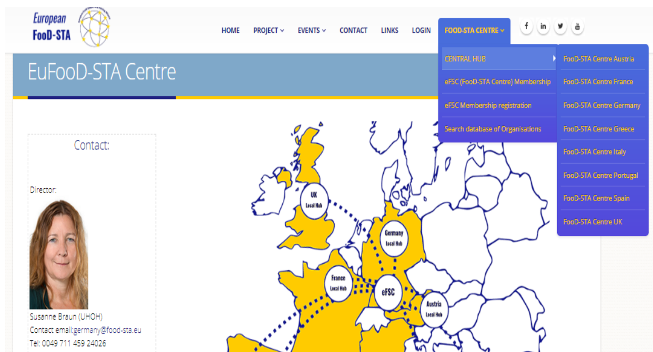
Figure 3. Screenshot of the access of the 8 local hub sites

Within the EuFood-STA web platform ( https://www.food-sta.eu/efsc_centre_hub ), 8 different sub-sites for the corresponding EuFood-STA local hubs have been established. These dedicated sub-sites present a general text (functions, objectives) in English and also in the corresponding national language. The different local hub sites can be reached by clicking directly on the corresponding country in the map or by selecting it from the scroll-down menu ( Figure 3 ).